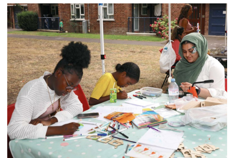
Summertime Special: Scenes from Hounslow Council's Housing Services' Summer on the Green events.