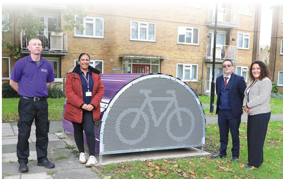
Hangar Management: One of Hounslow Council Housing's new bike storage facilities.